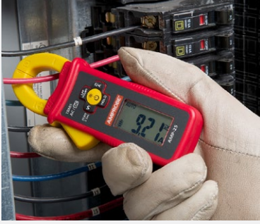
Troubleshoot electrical systems and measure AC/DC load current on exposed wires in a breaker panel.