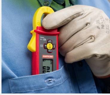
Pocket-sized for quick and easy spot checks of electrical systems.