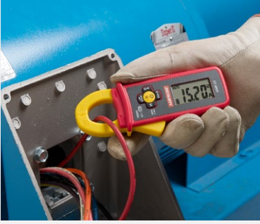
Utilize the inrush current function for motor start-up monitoring.