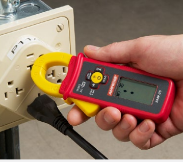
The non-contact voltage (NCV) function checks for voltage presence.