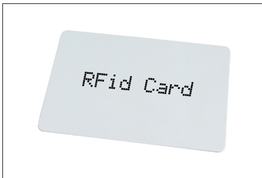
Figure 2: Identification card ( RFid Card )

RFid Reader is powered via a development system it is connected to. The presence of the power supply is indicated by a LED marked POWER. When the RFid Reader is turned on, a 125kHz voltage is supplied on its antenna. As a result, the antenna starts emitting an electromagnetic field necessary for reading the RFid identification card. As passive RFid card doesn't have its own power supply, it features a coil where the voltage is automatically induced by approaching the card to the RFid Reader's antenna. This voltage is necessary for the chip featured on the RFid card to work. The memory chip on the RFid card contains a unique identification code. This code is sent by the card when it is placed close to the RFid Reader's antenna. The code is received via this antenna. Then, it is sent to the microcontroller for further processing.