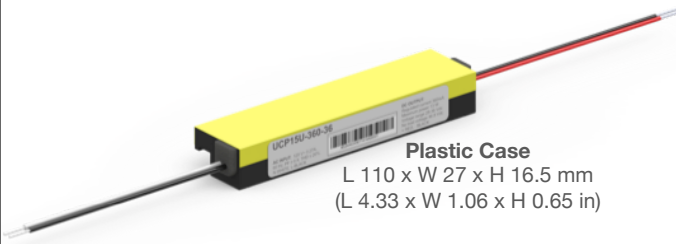
Plastic Case L 110 x W 27 x H 16.5 mm (L 4.33 x W 1.06 x H 0.65 in)